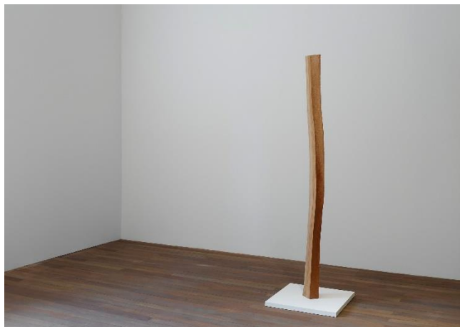
Choi In Su (b.1946, Korea)

Becoming a place-9 , 2021, zelkova, 170 × 12 × 9 cm